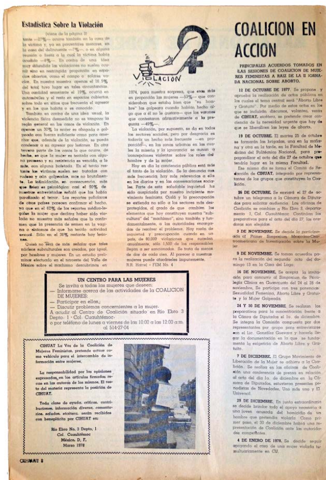
Figure 4. Cihuat , No. 8, 1978, Archive of Pinto ml Raya (Mexico City, DF), (Photograph of the author)

It is productive to consider this line of questioning with Latin American feminist theorist Gloria Anzaldúa's notion of conocimiento . Anzaldúa defines conocimiento as a complex form of embodied knowledge, created through the combination of social and political action with lived experiences. This form of subversive knowledge, according to Anzaldúa, is specifically reached through creative processes. She states: