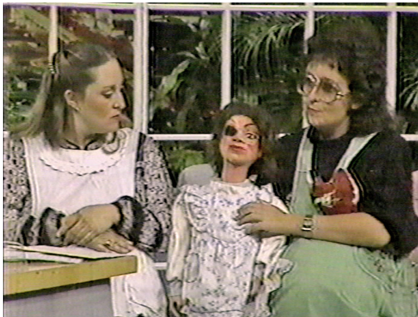
Figure 2. Polvo de Gallina Negra, ¡MADRES! Madre por un día, 1987, Still from video recording of performance